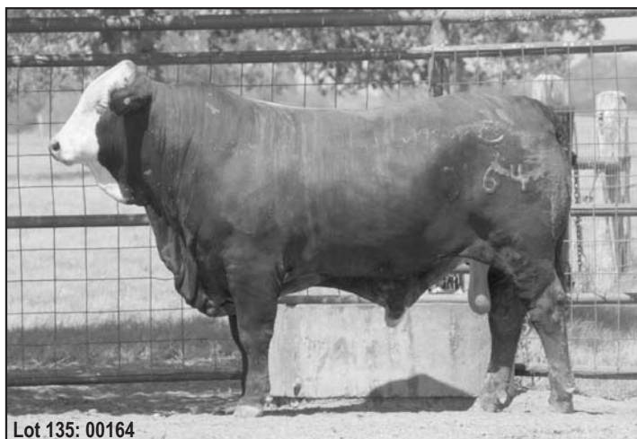
Lot 135: 00164