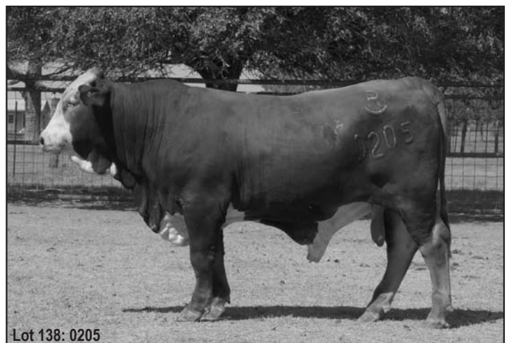
Lot 138: 0205