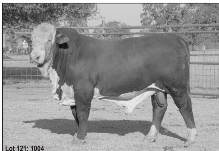
Lot 121: 1004