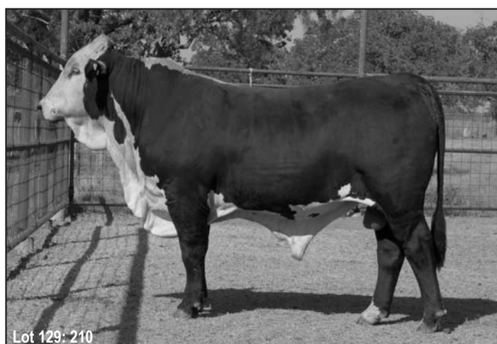
Lot 129: 210