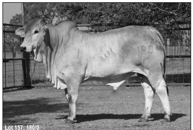
Lot 157: 180/0